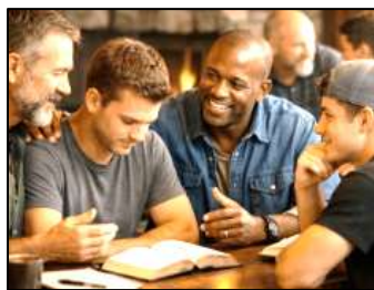
Talk about God