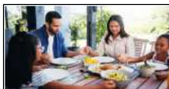
Pray as a family