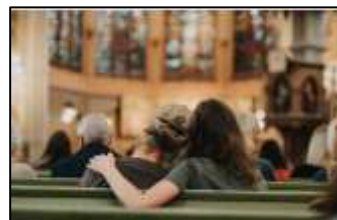
Lead people to the church