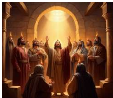
Meeting @ the Upper Room

Christian spirituality and Judaism have no argument with that. We agree. There's a privileged experience of God that can be had only in private, alone, in silence. To find God, to receive God's spirit, it's important that, at times, we pull away from the group, that we set off to the desert, to the chapel, to the lonely place, the quiet, to be alone with God. We see Jesus do exactly that. Mark's gospel tells us that when his ministry was most intense, when it was "too busy even to eat", Jesus pulled away, to be alone for awhile. There are times that call for withdrawal and silence. Meister Eckhart once wrote: "There is nothing in the world that resembles God as much as silence." All good spirituality shares this view.